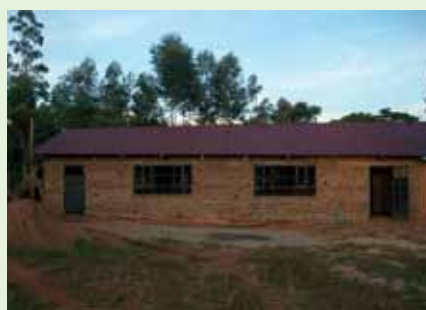
The multipurpose building will provide room for teaching life-improvement skills to the villagers of Bunyore and the surrounding area.

In next month's newsletter we will share some of the photos that our staff will bring back of the work there. Please keep this important work in your prayers.