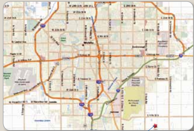
Steps to Life