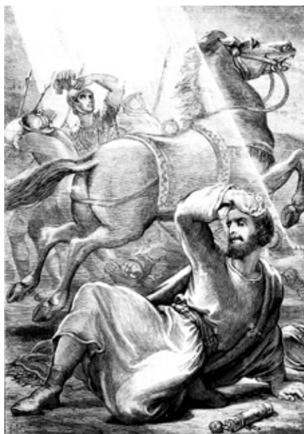
The conversion of Saul.

There are many stories of people who were atheists, communists, socialists, of various non-Christian re-