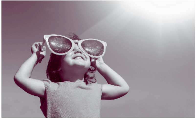
Sunlight can increase the ability to tolerate the stress of daily life, mood elevation, and ability to sleep and relax.