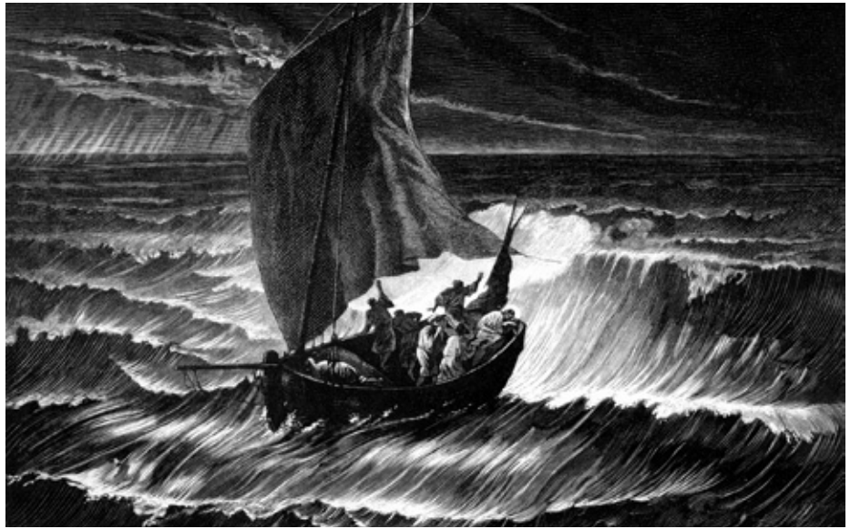
Jesus arises as the waves sweep over the disciples. Lifting His hands He says to the angry sea, "Peace, be still."

In Revelation 14:12 the remnant have two characteristics. They keep the commandments of God and they keep the faith of Jesus. Let's consider just for one more moment the faith of Jesus—literally. "When Jesus was awakened to meet the storm, He was in perfect peace. There was no trace of fear in word or look, for no fear was in His heart. But He rested not in the possession of almighty power. It was not as the 'Master of earth and sea and sky' that He reposed in quiet. That power He had laid down, and He says, 'I can of Mine own self do nothing' (John 5:30). He trusted in the Father's might. It was in faith—faith in God's love and care—that Jesus rested, and the power of that Word which stilled the storm was the power of God," His Father. The Desire of Ages , 336.