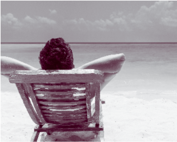
Single exposures of a large area of the body to ultraviolet light were found to dramatically lower blood pressure.