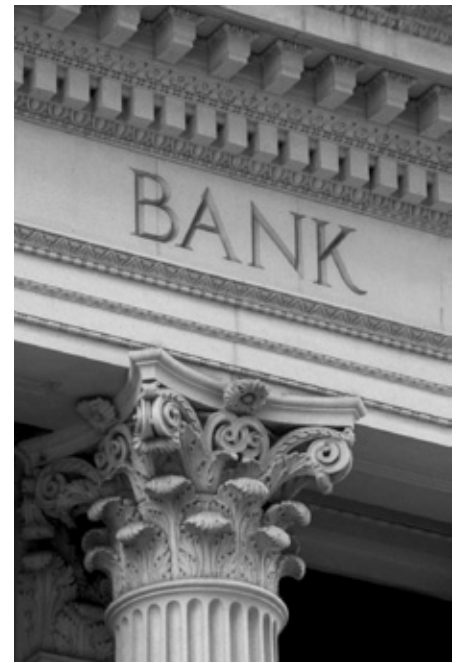
The financial structures of this world are consolidating. Bank after bank merge together in a colossal empire.

Again, they called for help, for the boat is beginning to sink. Another moment and they will be swallowed up by the angry waters. Suddenly there is a flash of lightning and they see Jesus lying asleep – undisturbed by the raging storm. In amazement they cry out, “Master, carest Thou not