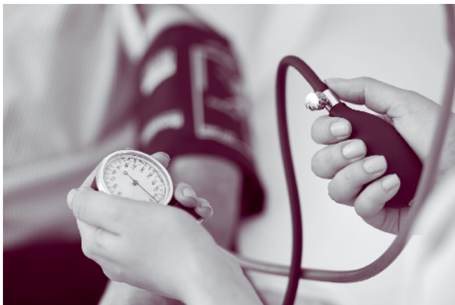
Exercise can be of great benefit in lowering the blood pressure.