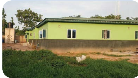
Nigeria: Central office for mission work serving the most populous country in Africa.