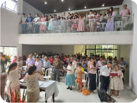
Bolivia: A new church building and mission headquarters for South America.