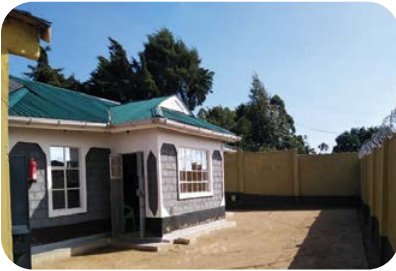
Kenya: Steps to Life evangelism and Free SDA ministries office.