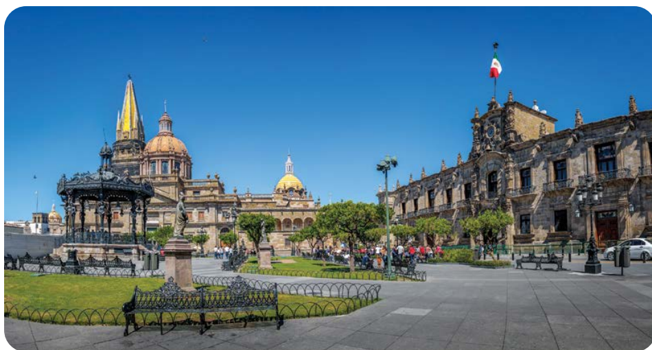
Guadalajara is the second largest Mexican city with the population of 5.4 million people, including its metro area.