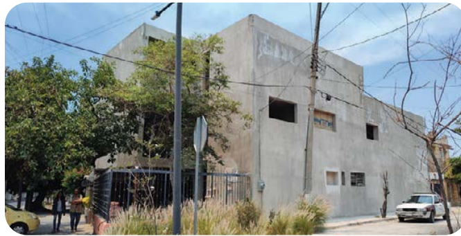
Mexico: A radio station, publishing house, and mission headquarters for the whole country.