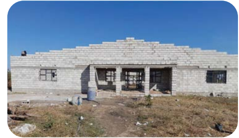
Zambia: A building under construction which will house the Zambian mission office.