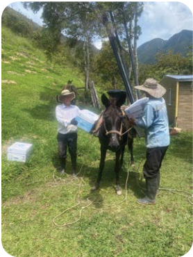
Loading up the mule for a trip down the mountain.