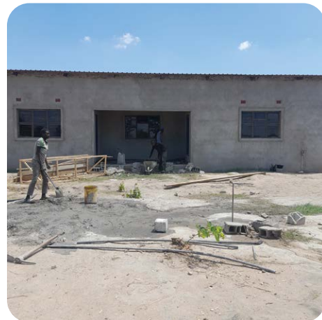
Zambia ministry building nears completion.