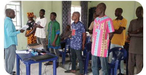
Baptism candidates are read the baptismal vows.

T he outreach efforts from Igbor extended to another settlement of Tyoadu about 6 km away from Igbor. Makurdi church held a one day literature distribution there and this led to two persons who responded and began worshipping at the church at Igbor. We assisted them with funds to fix their motorbike so they can attend church. Praise God they were amongst the souls who were later baptized. Presently we have three people attending from Tyoadu.