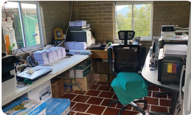
Workroom where books are prepared.