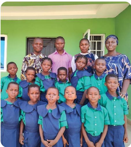
Orphaned children in school uniforms.