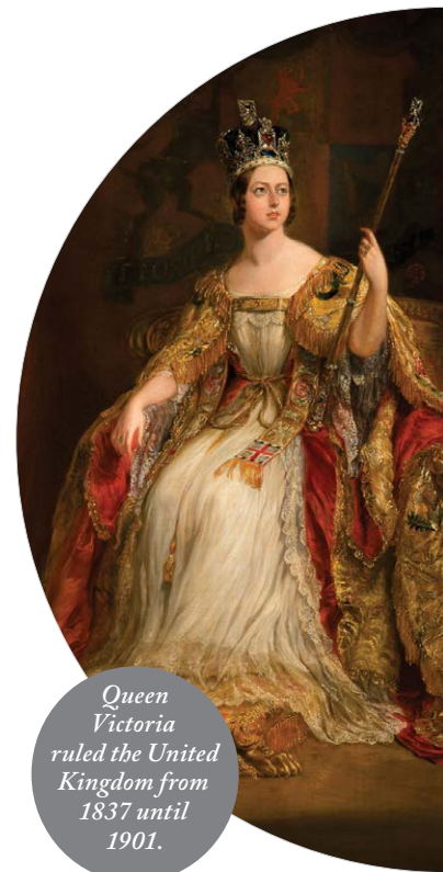
Queen Victoria ruled the United Kingdom from 1837 until 1901.

The owner answered, “Yes, my Queen, our best paper is made from rags.” The Queen became very quiet for a while, but then she asked, “But how can these dirty rags ever be made into clean white paper?”