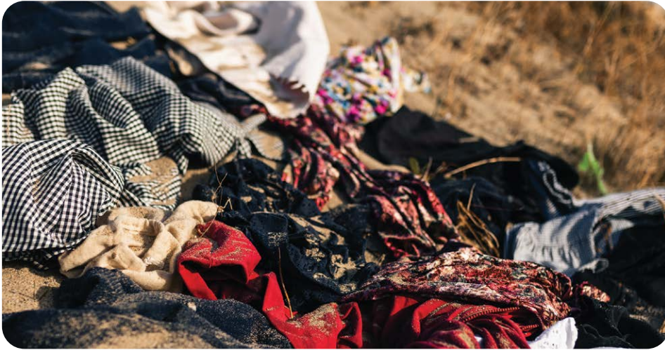
Even in the Victorian era, experts knew how to make the whitest paper out of dirty rags.

“Well,” the owner answered, “we have washers that remove all the dirt and grime followed by a chemical process that removes every bit of color, even from the darkest red rags.”