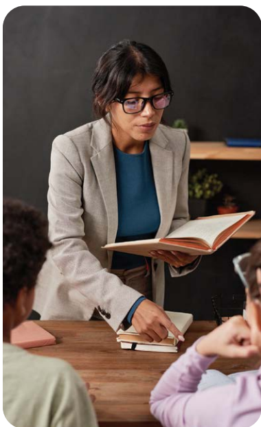
The best work you can do is to teach, to educate.