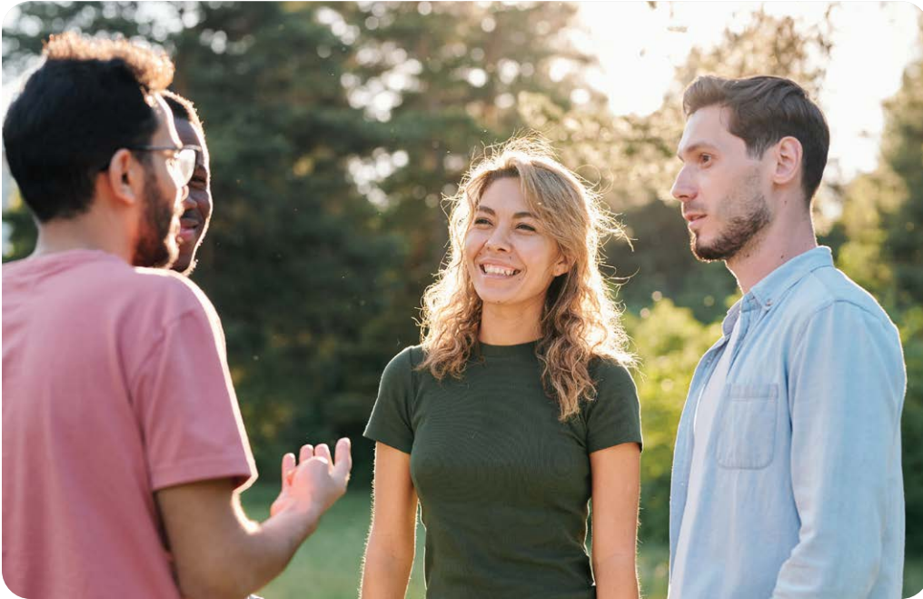
One of the most effective ways in which light can be communicated is by private, personal effort.

greatly appreciated. But the day is coming when, no matter how much money we may have, it will be worth nothing. Whether it be general operating expenses, evangelism, or missions, it is expensive to run a ministry. Now, while there is yet time, please ask the Lord for guidance in donating from the talents God has placed in your hands to help broadcast the message of salvation throughout the world.